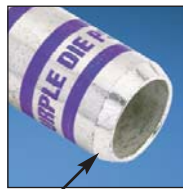
Corona Relief Taper